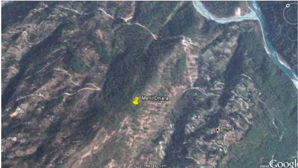
Melli Dhara Location